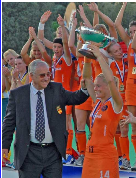
Skipper Minke Booij lifts the World Cup in Madrid

The Netherlands' women's hockey team was honoured with the title of Team of 2006 at the Dutch Olympic organisation's annual gala on 21 December. 2006 was a special year for the Dutch women. Having suffered the disappointment of failing to win gold in the Olympic games in Athens in 2004, they were the dominant team in the 2006 women's World Cup in Madrid, where they beat Australia in the final. The Dutch captain, Minke Booij was named the FIH Woman Player of the Year in October.