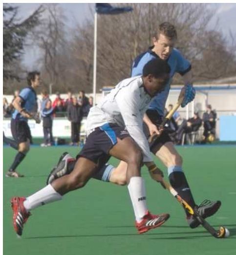
The EH Cup was won by Reading after a gripping final against East Grinstead.