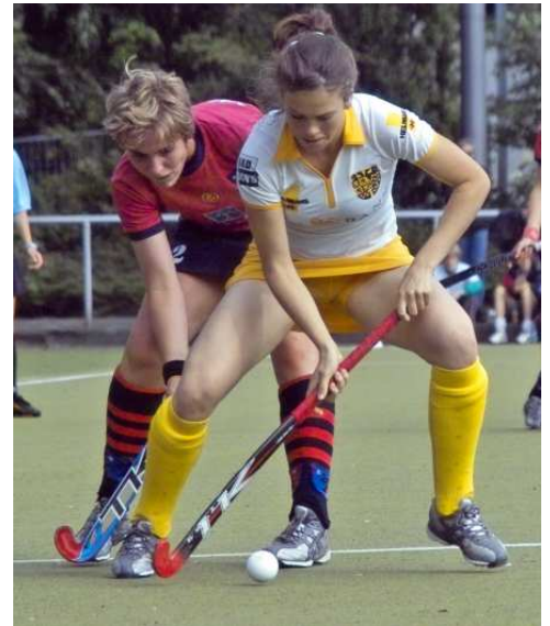
The women's European Club Championships in Berlin were won by Dutch side 's-Hertogenbosch. The picture shows action from the pool match between the Dutch and their hosts, Berliner