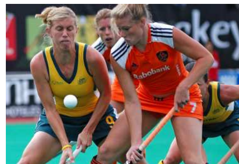
Dutch win the World Cup in Madrid