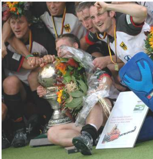
Germany win the World Cup in Monchengladbach